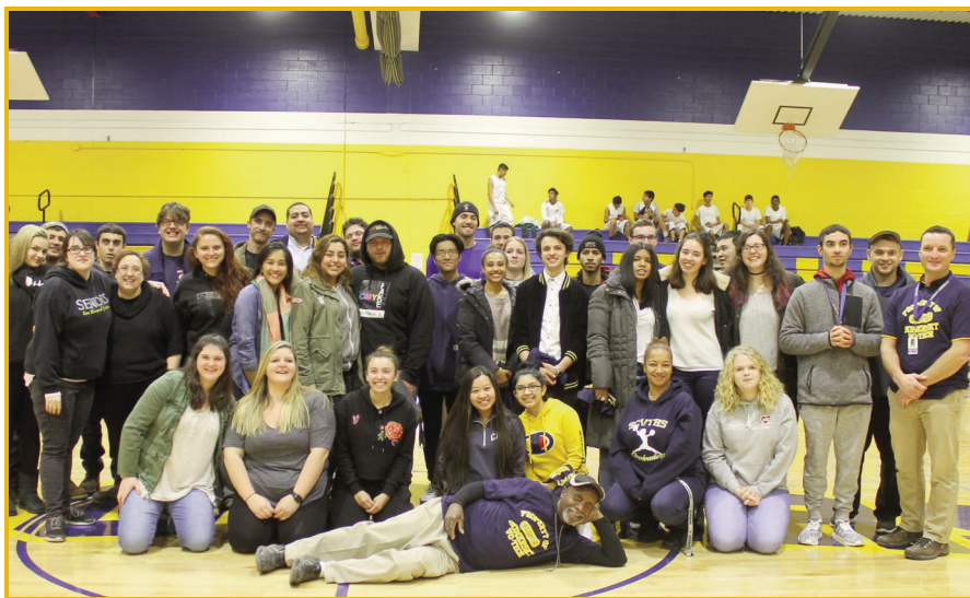
SCVTHS alumni at the school's first Alumni Homecoming event

Peluso went on to add, "The Homecoming Committee plans to continue to meet to discuss future events and ways